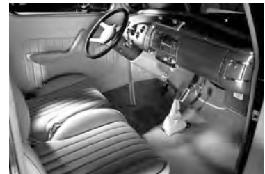
[ auto interior ]